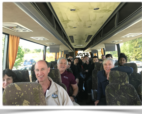
Photo of the Engineering club and STEM Core students on the LLNL field trip.

Foothill College | Spring 2017 | Issue 7