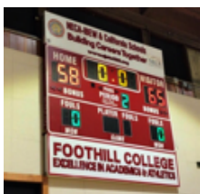
ASFC posted the final score: Students team won!

Students expressed how they really appreciated hearing so many First-Gen stories. We learned a lot from organizing this first summit, including having the event on National First-Gen Day instead and maybe shortening the time next year.