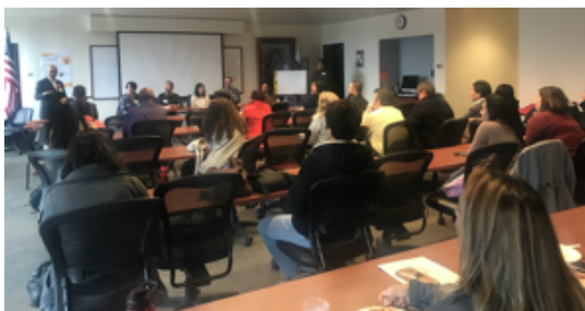
Faculty panel at First-Gen Summit