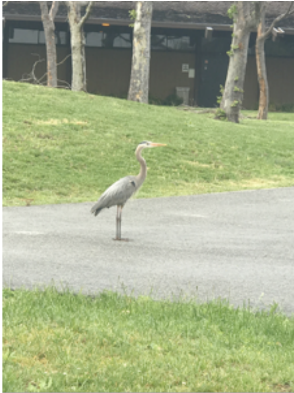
Want to share a little treat I got this morning: a visitor.

The past 12 hours demonstrated incredible teamwork and sense of urgency for our students, and we look out for each other. Thank you, Foothill family!