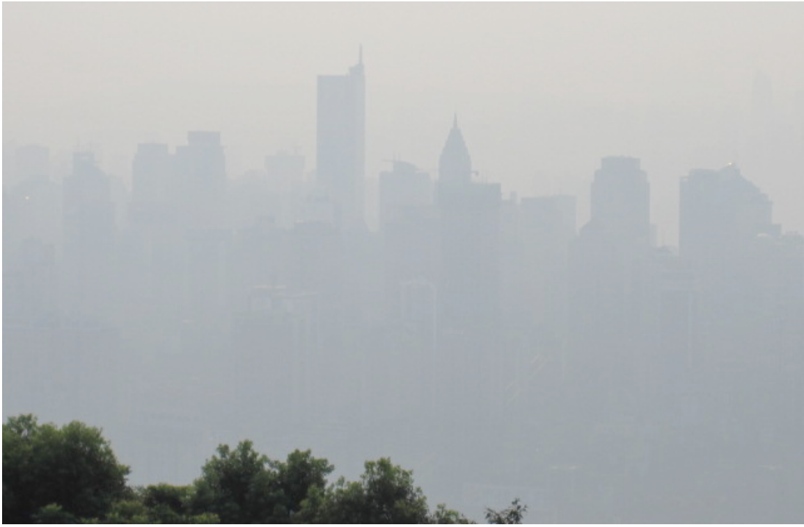
I took this picture, which gives you the San Francisco sense of the city, which Tuchman writes about, on a foggy, humid summer day.

Barbara Tuchman describes Stilwell's first unfavorable impression when she writes "the remote provincial 500 year old city with its steep streets and steps climbing up from the river, its open sewers and dank fogbound climate in winter was a 'sloppy dump'" (197). "Bomb-shattered houses were leaky and shaky, filth and smells were increased by the crowding, rats came out at night" (261). Stilwell's residence stood in contrast to this. It was modern and he had many servants. It was a Western-style house built by TV Soong (the brother of Madame Chiang Kai-Shek; he served as the Foreign Minister of China for most of World War II and sometimes schemed against Stilwell). It was provided to Stilwell by the Chinese government. As Tuchman describes it "Chungking occupied a rock promontory jutting into the junction of the Yangtze (pinyin: Yangzi) and Chialing (pinyin: Jialing) rivers and Stilwell's house was on the Chialing side with one story at street level and three stories overlooking the river, like a house in San Francisco." (261)