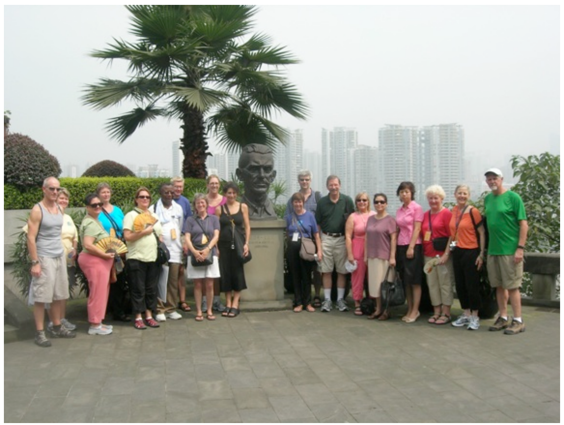
The picture above is of the Fulbright-Hays group in front of the Jialing River and next to Stilwell's statue. I am standing on the left hand side (three in from the middle) in shorts. (The summer weather in China is very warm.)

**In Chinese tradition, family names are rendered first before given names (emphasizing the community over the individual). As a result, I will capitalize the family name in my first reference to that name to emphasize it is the family name.