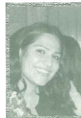
Hoda Fahimi Women in Iran: Before & After the Revolution Lecture & Documentary