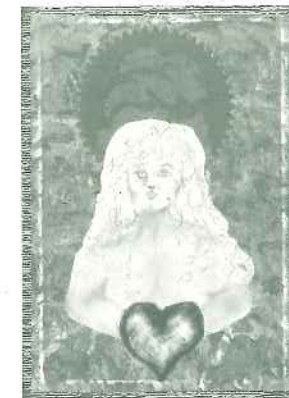
Pagan/Goddess Valentines Art Exhibit