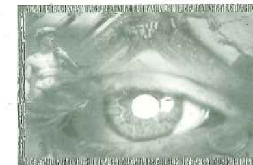
Gallery Exhibit featuring Female Financial Aid Recipients