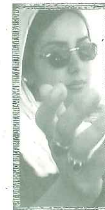
Film Screening of TEN