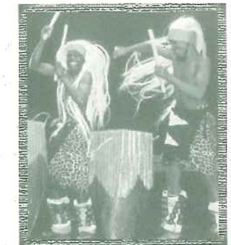
Children of Uganda Tour of Light Visit