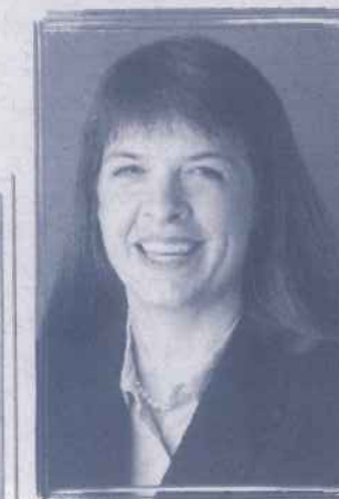
Sally Lieber Mountain View Vice Mayor/City Councilwoman