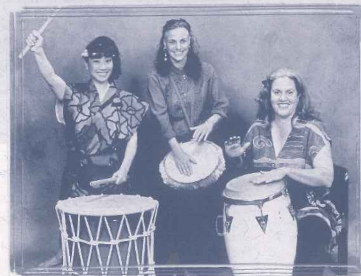
RhythMix multicultural drumming group