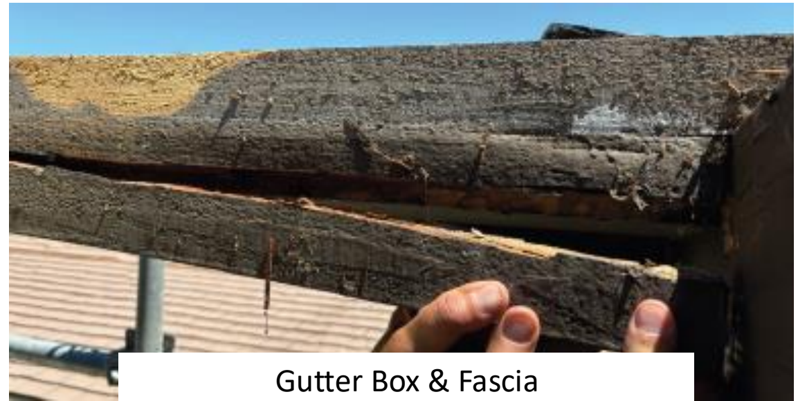
Gutter Box & Fascia Multiple Locations with Splitting & Rot