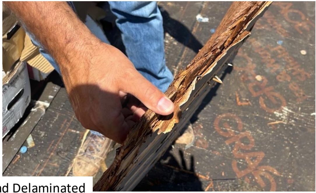
Plywood is Soft and Delaminated