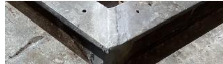
Metal Corners After