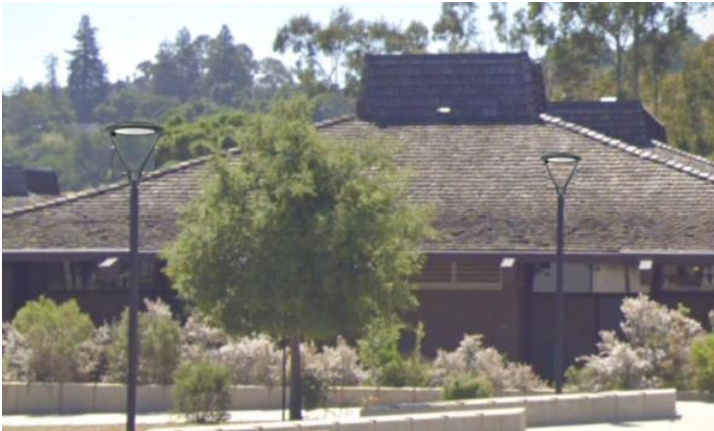
Gardco Pole Lighting - Rendering