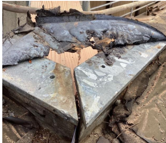
Metal Corners Before