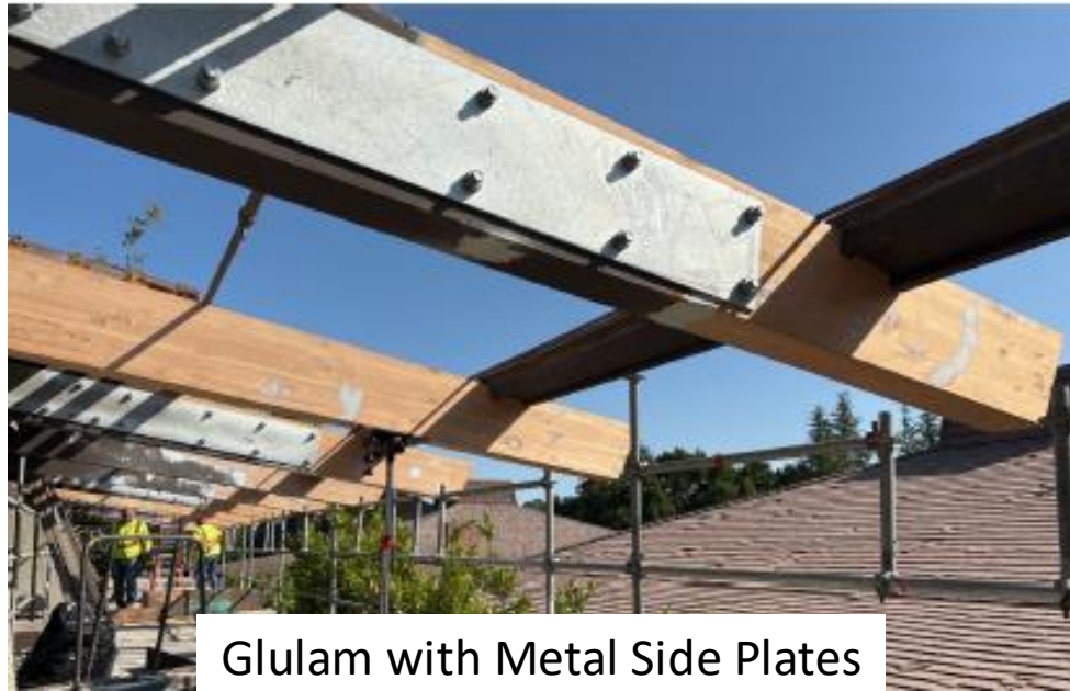
Glulam with Metal Side Plates