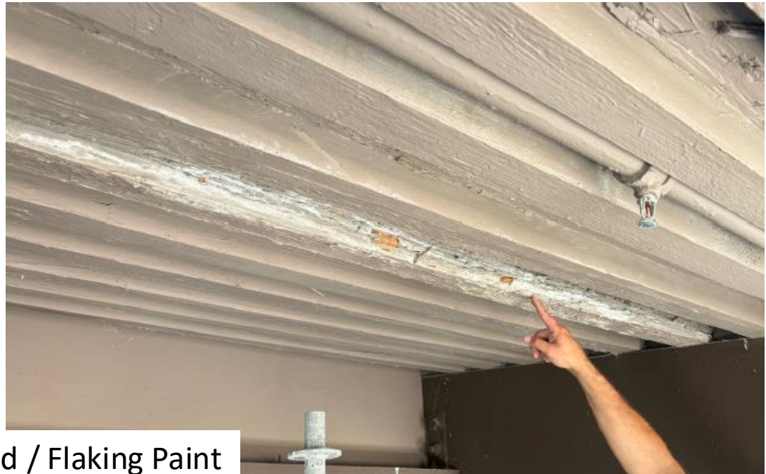
3x4's are Weathered / Flaking Paint