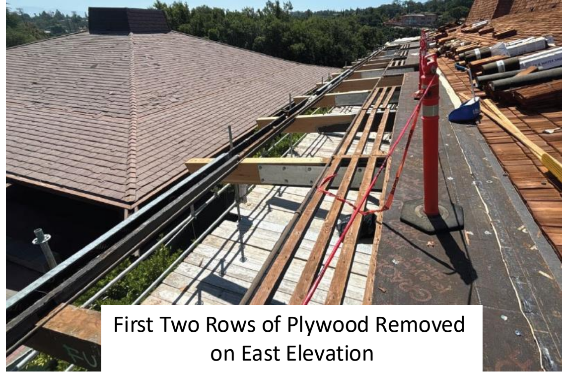
First Two Rows of Plywood Removed on East Elevation