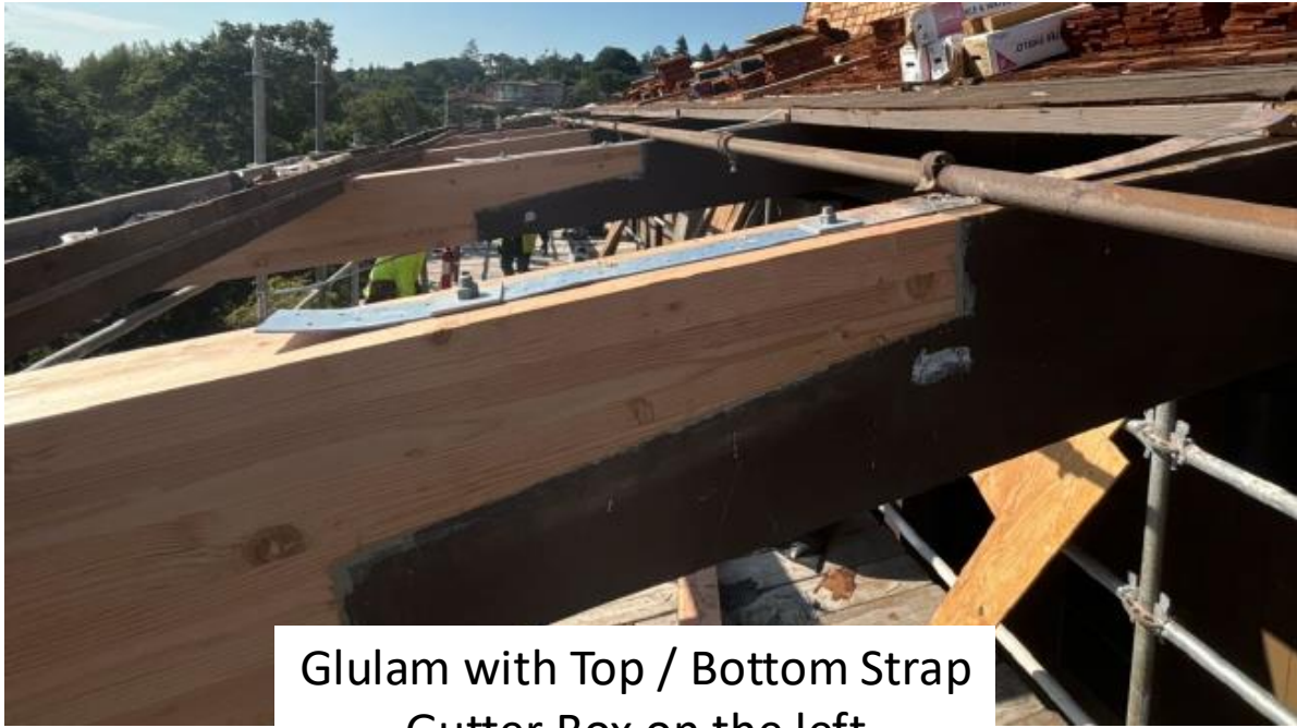
Glulam with Top / Bottom Strap Gutter Box on the left