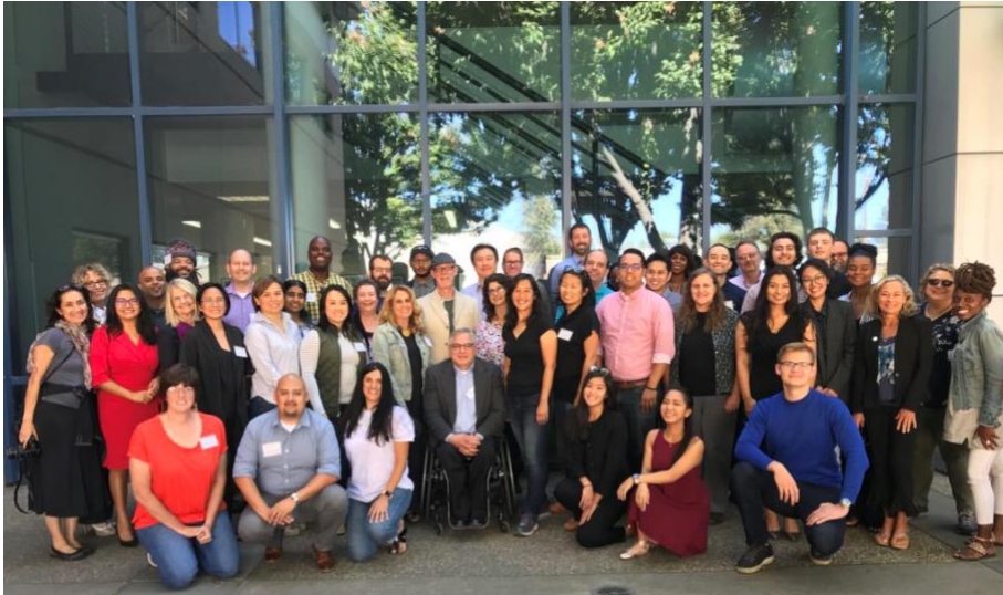
Founding Members of Governance

Believing a well-educated population is essential to sustaining and enhancing a democratic society, Foothill College offers programs and services that empower students to achieve their goals as members of the workforce, as future students, and as global citizens. We work to obtain equity in achievement of student outcomes for all California student populations, and are guided by our core values of honesty, integrity, trust, openness, transparency, forgiveness, and sustainability. Foothill College offers associate degrees and certificates in multiple disciplines, and a baccalaureate degree in dental hygiene.