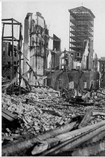
San Francisco Union square 1906: cited in Sources Slide