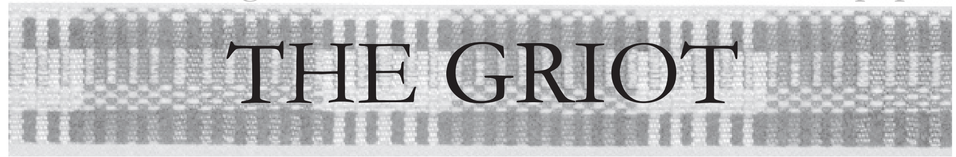
A Griot is a West African story-teller who preserves the oral history of the village or clan.