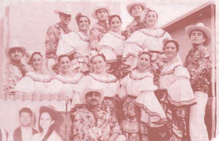
Cinco de Mayo Theater Performances